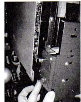
3. Attach Cashbar hinge to the adapter.