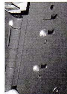
5. Adjust the alignment of the Cashbar