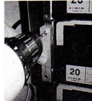
2. Attach hinge bracket adapter to pick module.